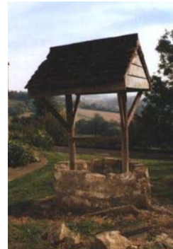
Jack and Jill Hill

Each year the Friends organise the Memory Trail to. This year the walk is on 16 th September and takes you near 'Jack and Jill Hill' the scene of the famous nursery rhyme and across the Ammerdown estate. We have sent an entry form to those who have taken part before. Please support us this year - return the enclosed form to receive entry details.