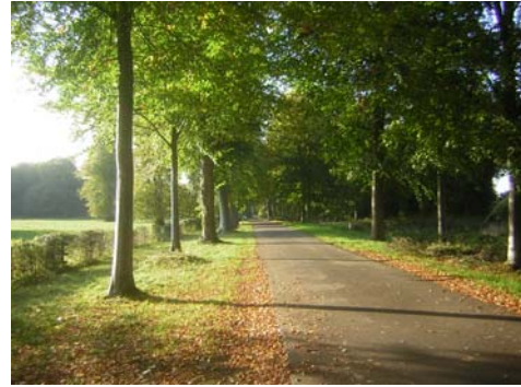
Driveway leading to the Ammerdown estate

This is our opportunity to highlight the need for better services and treatments for people with Alzheimer's disease and their carers. On 21st September Alzheimer associations worldwide are asked to raise their voices against ignorance and the stigma of dementia. To take part in a World Alzheimer's Day event this September we invite you take part in the 14 th annual RICE Memory Trail.